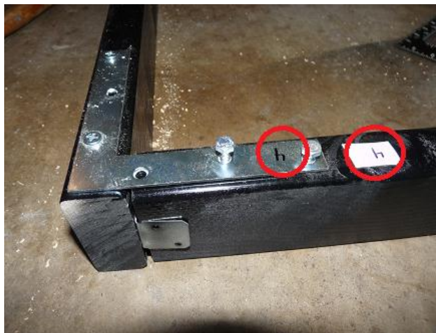
Figure 12 – mark the corners