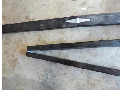
Figure 4 – completed walls with hinges