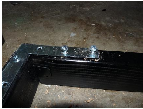
Figure 11 – bolts pushed into holes but up enough to grab