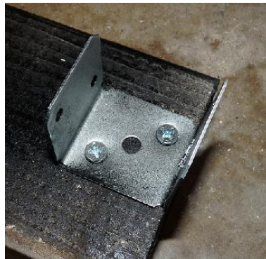
Figure 6 – End wall bracket Screwed down

12. Use 2 screws to screw the bracket to the 2X4. See in Figure 6