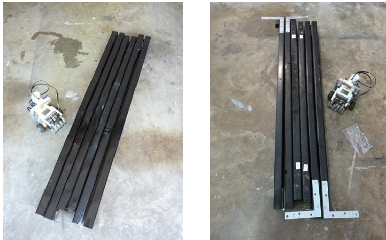
Figure 14 – Table walls folded (left with option 1 corners, right with option 2 corners)

With either of the corner options, this is my suggestion for portable option for the FLL practice table.