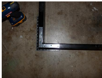
Figure 8 – Angle bracket placement