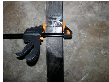
Figure 2 – use a clamp to make sure the wood is square