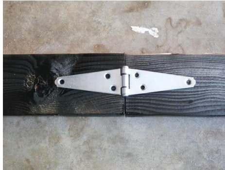
Figure 1 – hinge placement

Note: A clamp can be used to make sure the 2X4s are straight and even. Place the "C" clamp or other type of clamp where the 2 2X4s join as shown in Figure 2 below. Any type of clamp can hold the wood in place.