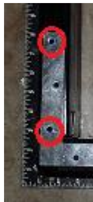
Figure 9 – side wall bracket holes