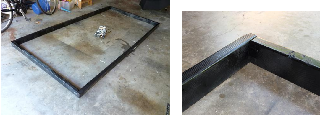
Figure 13 – Walls up to form the full field