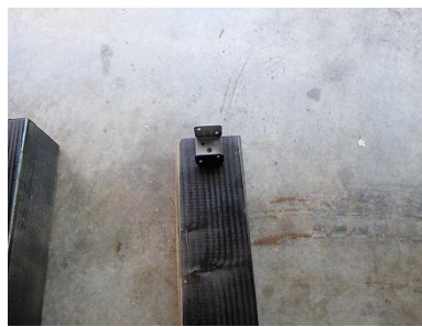
Figure 5 – placement of ridged bracket even with end of board.

11. Use the 1/8" drill bit to drill starter holes in the back of the bracket.