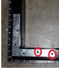
Figure 10 – Angle bracket holes in end wall