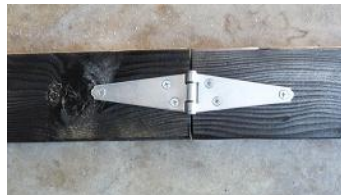
Figure 3 – hinge placement.