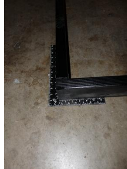
Figure 7 – square the corner